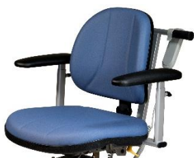
140-00135-00 blue vinyl

Vinyl has an airy, ventilated slick texture.