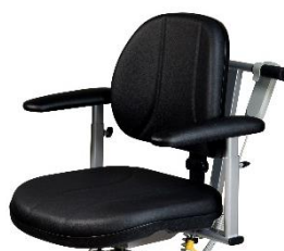
140-00247-02 black art leather

Seat 450x470mm / 18x19in, Backrest 360x410mm / 14x16in